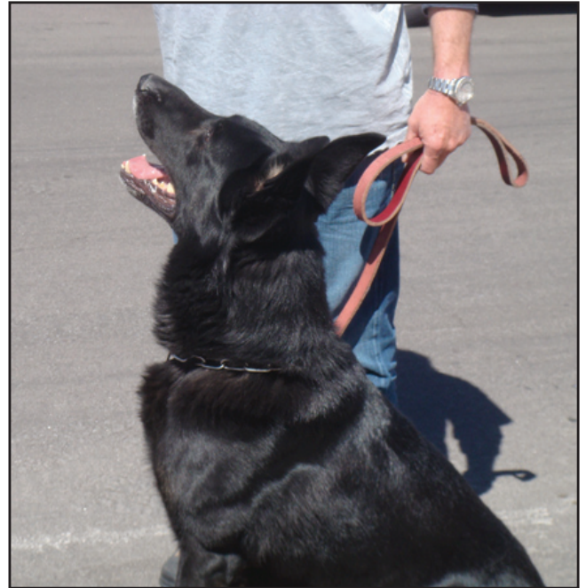
Popeye can find marijuana, rock cocaine, powder cocaine, ecstasy, meth and heroin.

In recent years, the devastation wrought by the methamphetamine scourge has reached into Nevada families and destroyed the future of our children. Methamphetamine addiction is a life-long sentence to the addicts, their families, and to the public. Over 80% of those incarcerated in Nevada jails and prisons for all types of crimes have one thing in common: methamphetamine abuse.